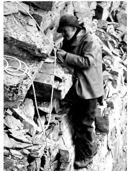
In his element on Prince Leopold Island.